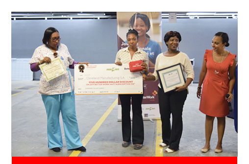
Share Hope - Factory Clinic Award Cermony to Clevland Manufacturing S.A