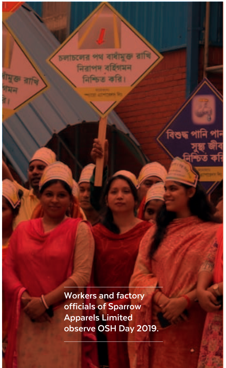
Workers and factory officials of Sparrow Apparels Limited observe OSH Day 2019.