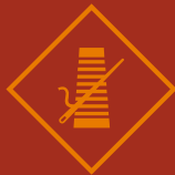
Influencing GSC actors