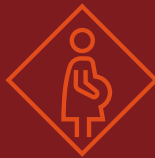
Paid Work & Care