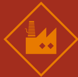
In Factory Services