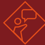
Voice & Representation