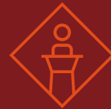
Leadership & Skill Development