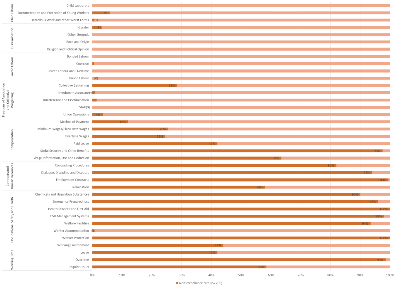
Non-compliance rates by Compliance Point - June 2015 - December 2018